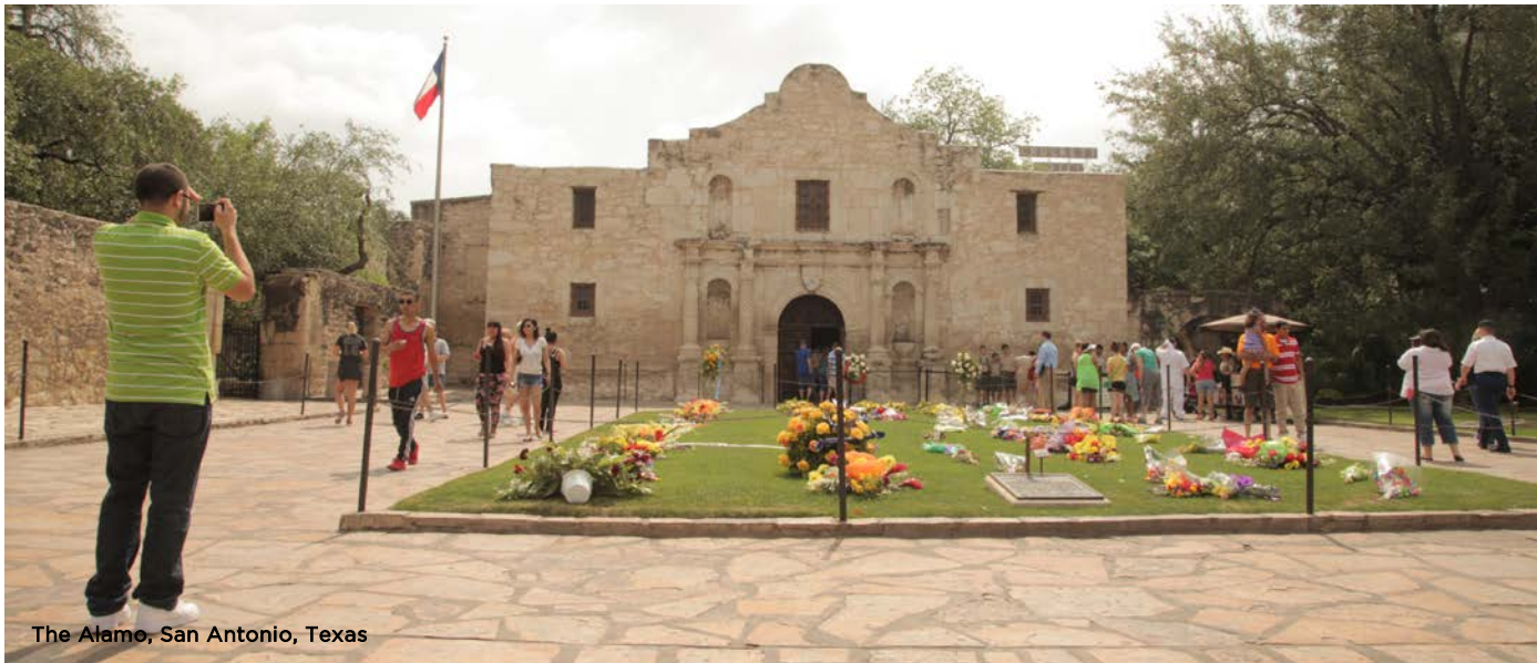
The Alamo, San Antonio, Texas

Get an early start and head into Texas Hill Country to Fredericksburg, where walking tours illuminate the area's German heritage. Afterwards, sample local culinary favorites and brewing at the town's bistros, bakeries and beer gardens. Hill Country also takes pride in its barbecue tradition, with mesquite coals lending a signature flavour to meat, including tender brisket. Seek out an iconic barbecue restaurant such as Backwoods BBQ. Accommodation: Fredericksburg, Texas